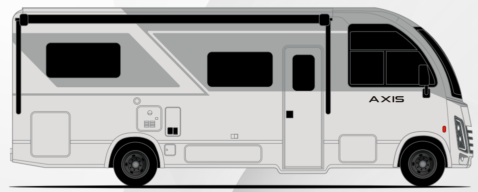
MERCURY EDITION - PARTIAL PAINT